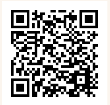
CFA Society Hong Kong Candidate Services

The choices of the calculation questions can be very close sometimes, so 4 decimal places are good enough to distinguish among them without occupying the display too much. The exam venue can be cold due to the air conditioning, so bring one more clothes can reduce the uncertainty on your performance