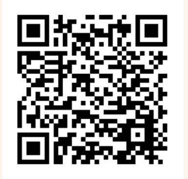
CFA Society Hong Kong Candidate Services